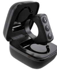
Remote control (x1)