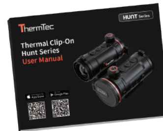
User manual (x1)